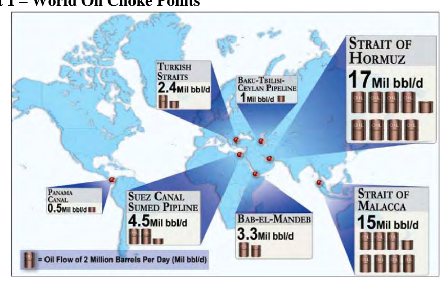
Chart 1 – World Oil Choke Points 116

Thus, by virtue of the expansive nature of the oil distribution network, there are myriad points of vulnerability across the system brought about by the location of the network or the significant convergence of resources within specific elements of the chain (e.g. within super-tankers or at major oil refinery stations). An additional critical security consideration within the system is the nature of the various choke points in shipping. Chart 1 below shows that over 30 MBD transit through two of the main transportation choke points, namely the straits of Hormuz and Malacca. Should these key areas be closed, secondary routing options would need to be implemented to include movement of oil via yet to be constructed pipelines. Until a workable alternative is in place, the overall distribution system presents a level of risk for the entire oil industry.