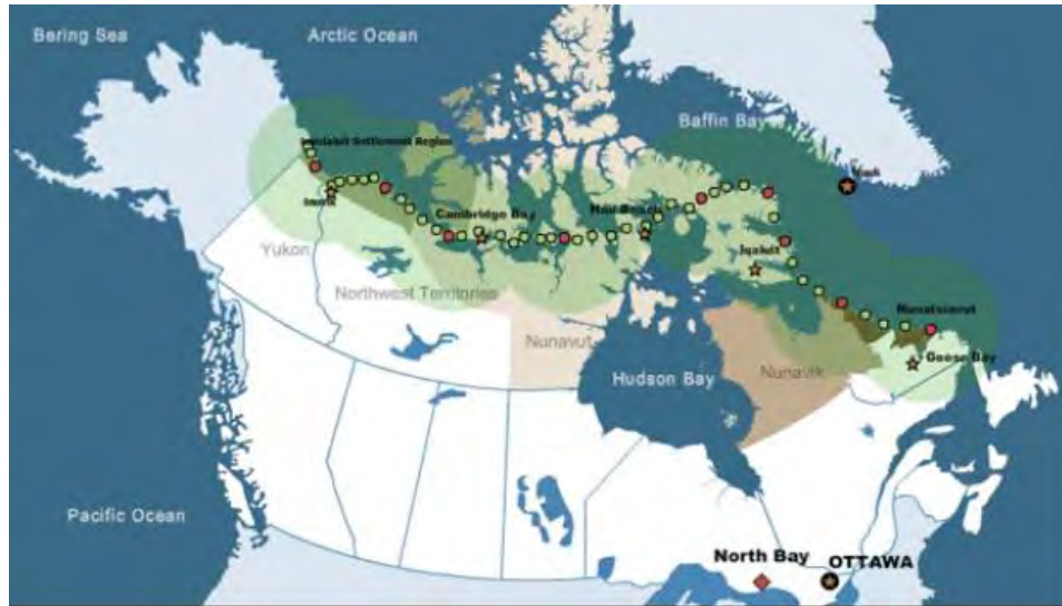
Figure 1- The Canadian North Warning System Radar Site laydown

After nearly 40 years, the Russian long-range aviation (LRA) incursions have become more frequent and adventurous in nature as a result of Russia's emerging assertiveness. 31 Advances in technology including stand-off cruise missiles 32 which no longer require the overflight of North America to range their targets combined with stealth technologies, enable the air and submarine launched cruise missiles to remain undetected by NWS radars. Blended with an emerging Chinese threat intermixed with rogue state actors (North Korea and Iran) and non-state actors; we see a situation whereby the threat has outpaced the capabilities designed to counter it, eroding the defence credibility of Canada in the eyes of the US, and with it the deterrent effect of NORAD.