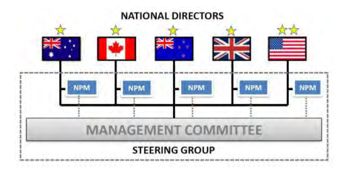
Figure 1.2 - ASIC Management Level Organization

has undertaken to ensure the correct National Director was selected as national ASIC representatives. Figure 1.2 depicts the evolved management structure within ASIC.