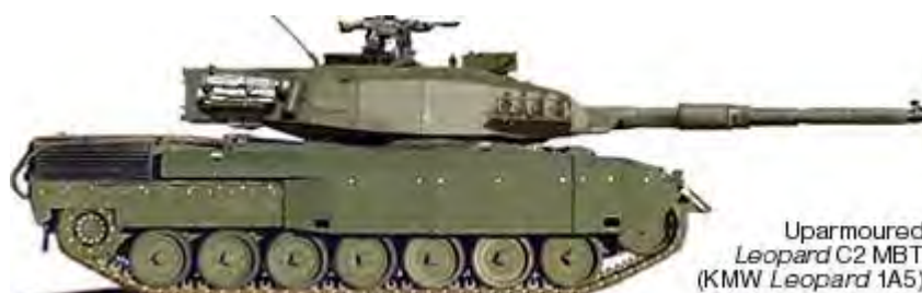
Fig 1.3: Canadian Forces Leopard C2 MBT Up-armoured for Afghanistan

Protection was without a doubt the predominate factor in acquiring the Leopard 2 MBT, although the Leopard C2 is old and need of replacement, it is doubtful that a new MBT would have been acquired if the Leopard C2 provided the required level of protection needed in Afghanistan. The Leopard 2 MBT would not be the only heavy weight vehicle that the CA would acquire based on the requirement to improve the protection of its soldiers.