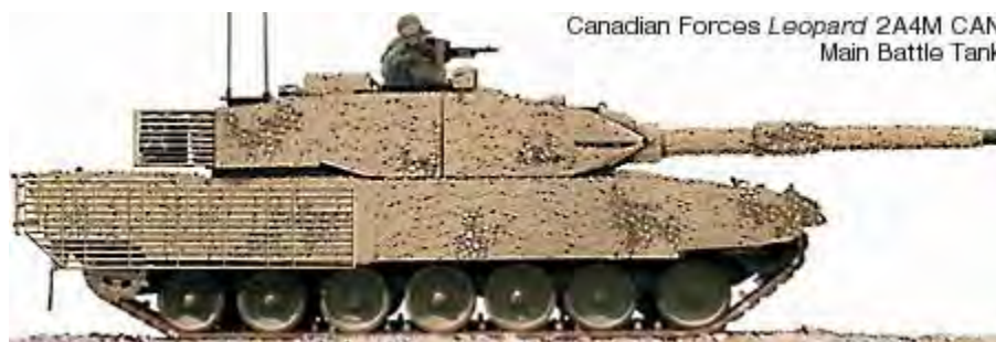
Fig 1.4: Canadian Forces Leopard 2 A4M CAN MBT In Afghanistan