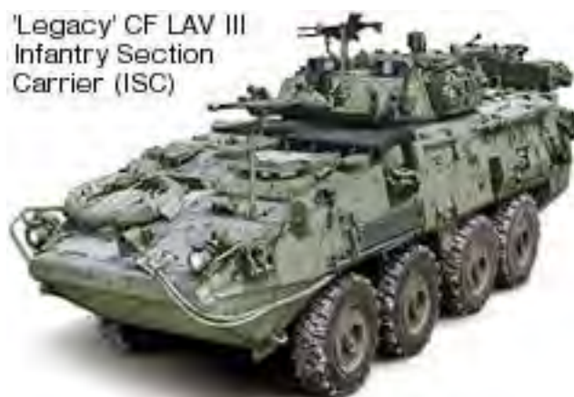
Fig 1.1: LAV III IFV: Infantry Section Carrier Version.

including a thermal imager. It is manned by a crew of three (driver, gunner, and commander) and normally has an Infantry Section of seven soldiers in the crew compartment. The LAV entered service with the CA in 1999. 22