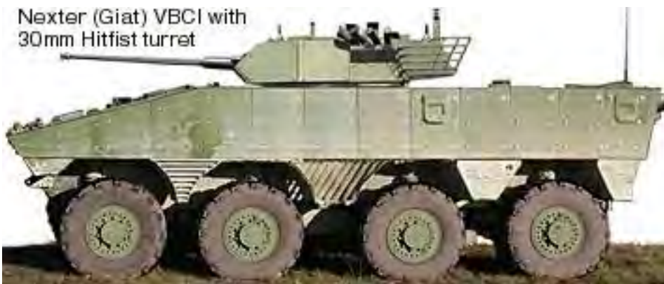
Fig 1.7:Nexter (Giat) VCBI 30: Potential CCV Candidate