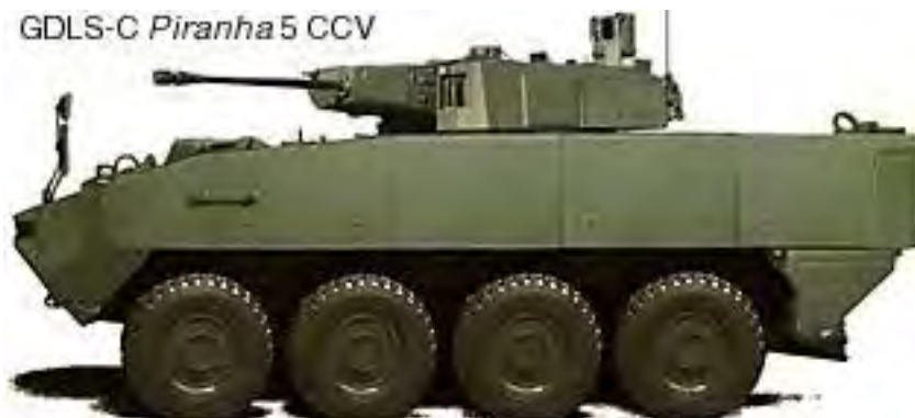
Fig 1.6: General Dynamics Piranha 5: Potential CCV Candidate